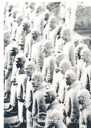
Terra Cotta Warriors in Xian

We will visit such cities as Shanghai, Beijing and Xian. We will cruise for three days on the Yangtze River, marvel at the scenery along the Li River, explore the Temple of Heaven, the Forbidden City and the Summer Palace. We will visit the Terracotta Warriors and walk on the Great Wall. We will ride trains through the Chinese countryside. And we will talk to the people of China, to help them practice their English and to help us learn about them. Xi xi.