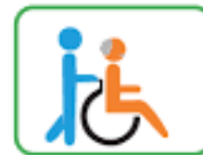
Walking or moving around