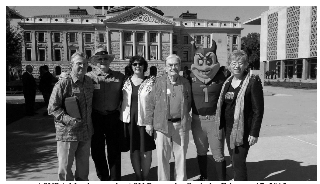
ASURA Members at the ASU Day at the Capitol – February 17, 2015

This report is for distribution at the Annual Meeting April 18, 2015, 1:00 p.m. ASU Tempe Campus, Memorial Union Alumni Lounge