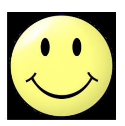
Vice President to be determined